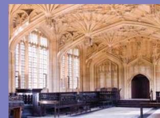
Divinity School, Bodleian Library